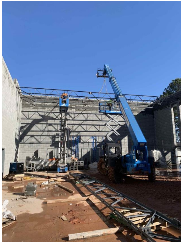
Bar joist installation at new gym