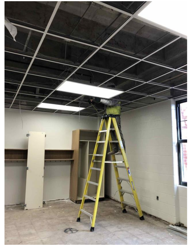
Light fixture installation